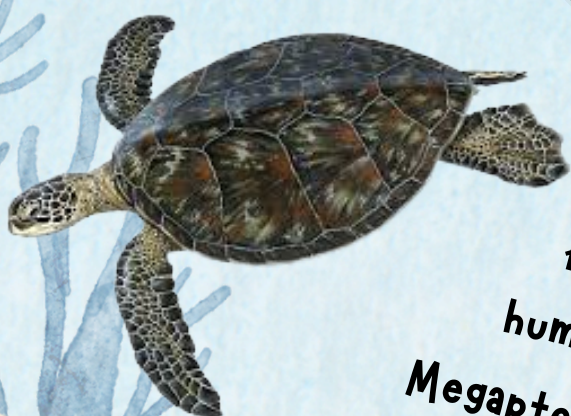
Ch'ééh Digháhii green turtle Chelonia mydas