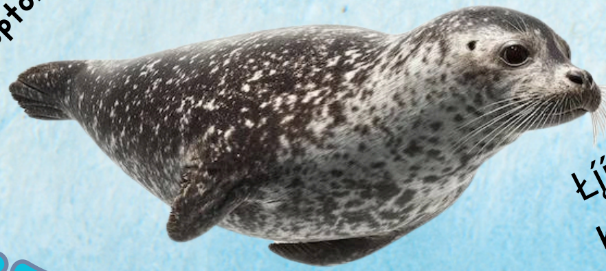
Té-Sido Naaldlooshii'íí'kizhigii' leopard seal Hydrurga leptonyx