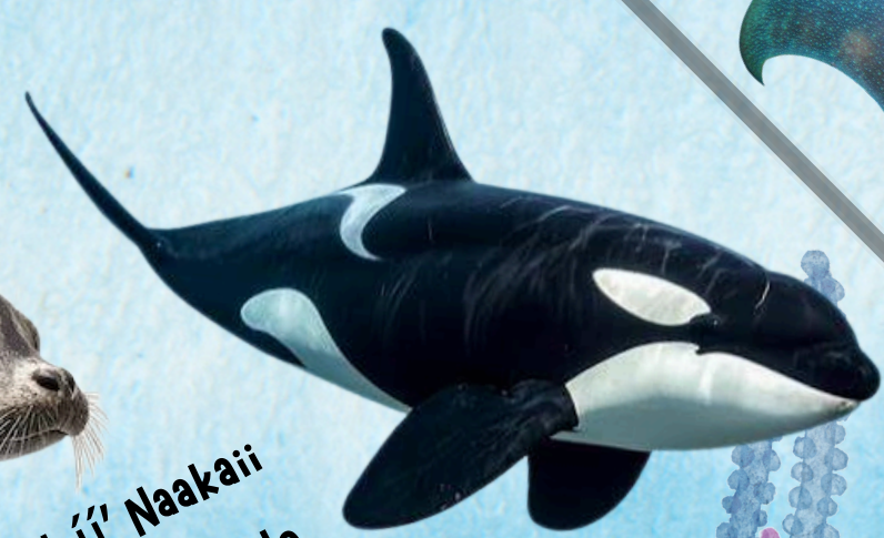
Éj' Naakaii killer whale Orcinus orca