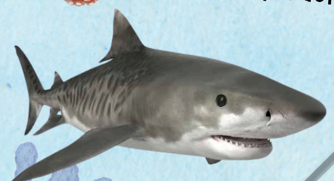
tó' hashkéhé tiger shark Galeocerdo cuvier